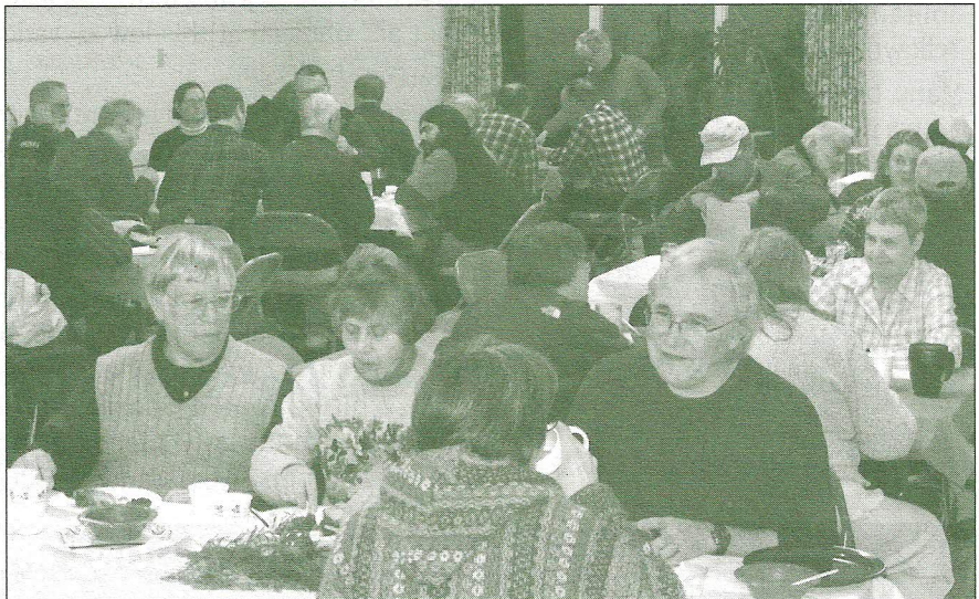
Christmas Count participants at Chili Feed.