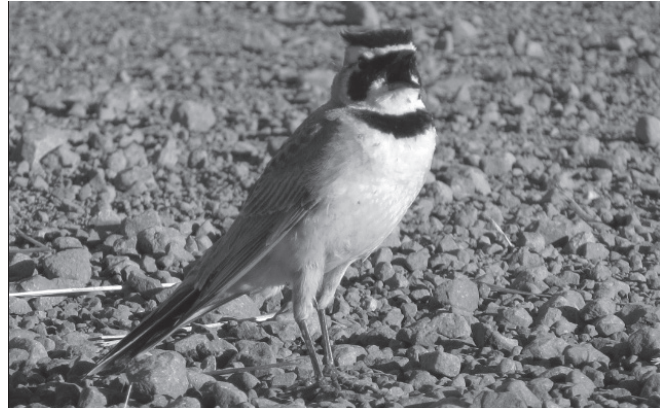
Streaked Horned Lark at Baskett Slough National Wildlife Refuge (Polk County).

Other threats include predation by skunks, raccoons, harriers, kestrels, dogs, and feral cats.