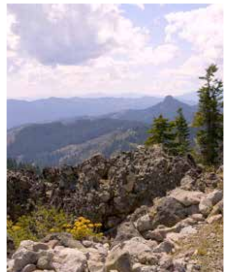
Cascade-Siskiyou National Monument

Most people recognize the importance of protecting natural areas: they clean the air and protect watersheds, protect pollinators, encourage healthy recreation, mitigate storm damage, sequester carbon, and provide habitat for fish and wildlife. By the government's own admission, the vast majority of public comments submitted during this national monument review process were "in favor of maintaining existing monuments." Most people want to protect our natural areas, for themselves and for their children. That's good planning for the future. Can we follow through?