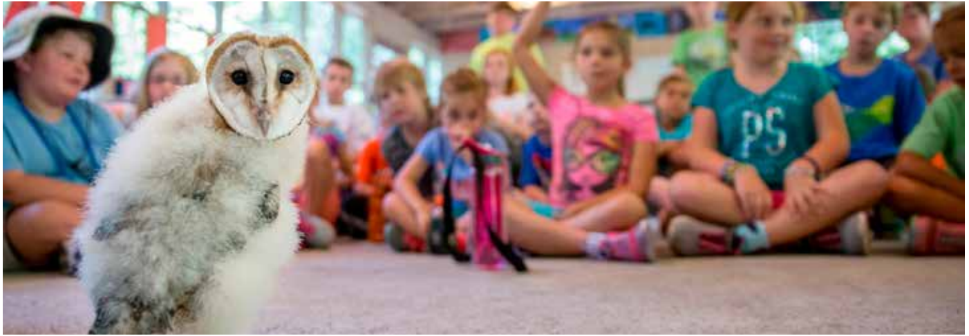
Barn Owl.