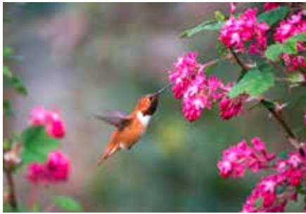
Rufous Hummingbird on Red Flowering Currant

It's the time of year when we have an opportunity to create bird-friendly yards! Get out in the garden to work some landscaping magic with the purpose of welcoming the migrating birds to nest and raise their young in our area. Birds have been using the Northern Hemisphere for nesting over thousands of years. In recent years, human impacts on the environment have drastically changed their world, as