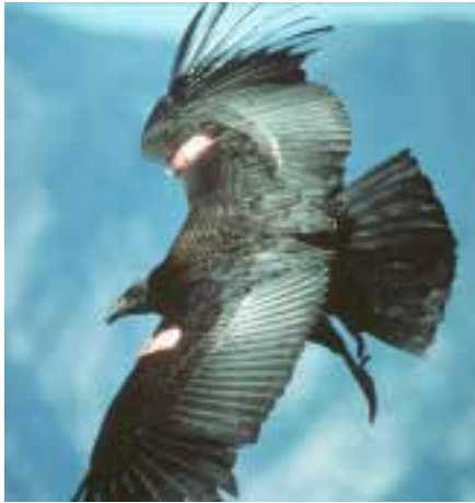
California Condor ( Gymnogyps californianus ).