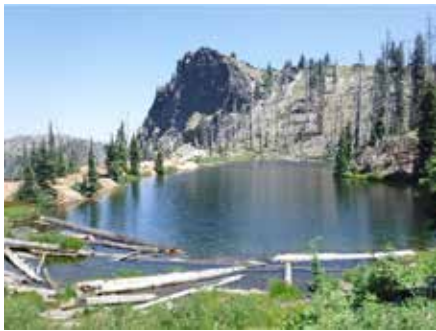
Shadow Lake in the Marble Mountain Wilderness.

Oregon's hiking guru takes us on a slide show tour of new trails he discovered while researching the latest (fourth) edition of his book,