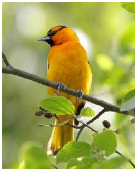
Bullock's Oriole, Grants Pass

We are an all-volunteer organization. We depend on the energy and commitment of our wonderful members and volunteers to make our activities a success and to have an impact on environmental and educational issues in our community. Please join in! Become a volunteer and help us advocate for the birds and for habitats we all need to thrive.