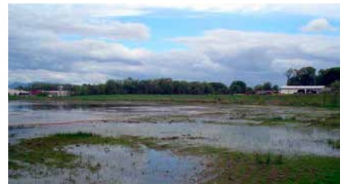
Bertelson Nature Park