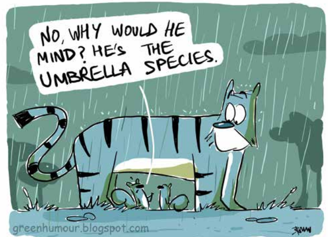
art credit: Rohan Chakravarty, www.greenhumour.com/2012/06/umbrella-species.html