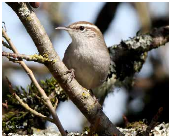
Bewick's Wren in Bertelsen Park.