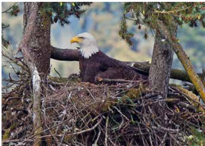
The Skinner Butte resident Bald Eagles are raising chicks again this year!