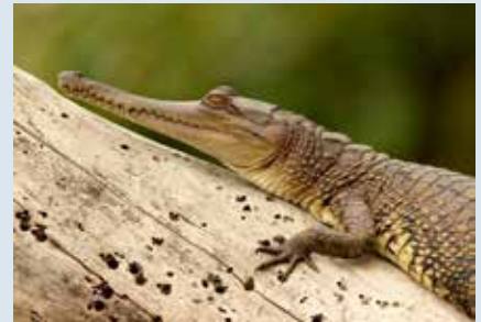
Slender-snouted Crocodile, a species found only in the Congo Rainforest Biome of Central and West Africa.

Tuesday, May 24, 7:30 p.m. Eugene Garden Club 1645 High St., Eugene