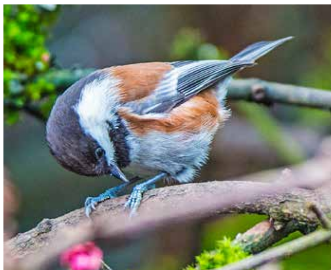
Chicadee working on a seed.

Eurasian Collared-Doves continue their expansion into western Oregon. This is a bird unknown in Oregon just a few