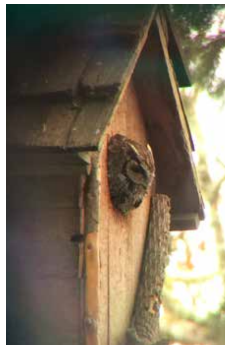
Screech Owl in Area 10A.