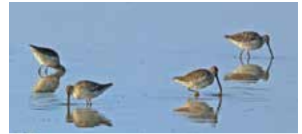
Long-billed Dowitcher, Fern Ridge

average, reduces the production of animal products by 40 percent, and replaces pesticides and fertilizers with sustainable farming methods.