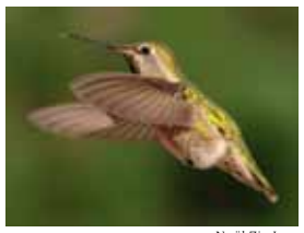
Noël Zia Lee

Over the past few winter months, my husband and I have hosted a female Anna’s Hummingbird at our property. This is the first year we have had one consistently all winter. We live at 1000-foot elevation, so we tend to have cooler temperatures than the valley floor. I know many folks have been hosting overwintering Anna’s here for the last decade, but this is new for us. It is unusual to see a bird during the winter months that we normally only see in the spring.