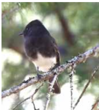
Black Phoebe

Be sure to put Sunday, December 30, 2012, on your calendar for the 2012 ECBC. Please plan to join a team or watch birds in your yard and have a fun day of birding. Your results are entered into the 112-year record of all the Christmas Bird Counts around the continent and are used by scientists for research on bird life. Thanks again to all of you who participated and helped to make the 2011 ECBC one of the best in the world!