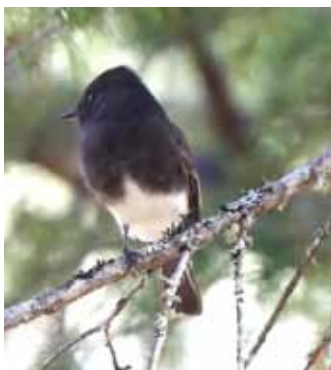
Black Phoebe

Be sure to put Sunday, December 30, 2012, on your calendar for the 2012 ECBC. Please plan to join a team or watch birds in your yard and have a fun day of birding. Your results are entered into the 112-year record of all the Christmas Bird Counts around the continent and are used by scientists for research on bird life. Thanks again to all of you who participated and helped to make the 2011 ECBC one of the best in the world!