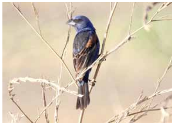
Blue Grosbeak