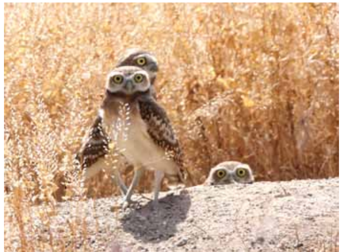
Burrowing Owls at an Oregon hot spring