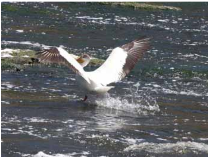
American White Pelican landing in Klamath River

What do they have in common? All contain important regulations that ultimately protect birds and their habitat (as well as protecting people). All will be decimated under the current budget bill. Let your congressional representatives know that you do not support the many egregious anti-environmental riders contained in the proposed budget.