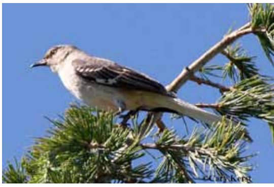
Northern Mockingbird