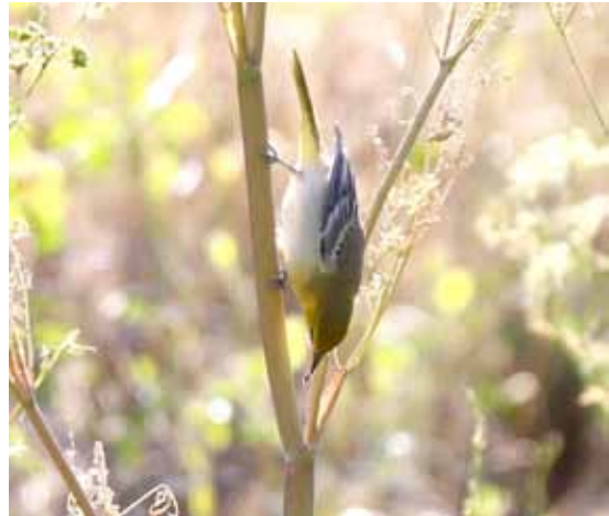
Bullocks Oriole at Shasta River