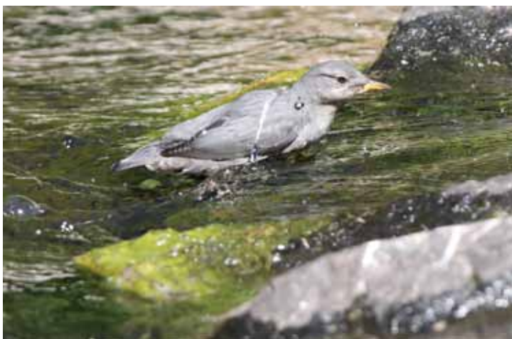
American Dipper

So, that Mockingbird, even though he knew nothing of me and wanted nothing of me, gave me a sense of balance and buoyed my feelings as I remembered looking out of those same windows decades ago, with my mother at my side, helping me learn and identify the backyard birds. It was one of her many gifts to me.