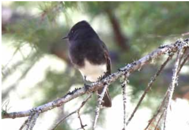
Black Phoebe – by Cary Kerst

Lane County Audubon Society is an all-volunteer organization, and our members are very proud of the energy and diversity of talents volunteers bring—we couldn't do it without them! Volunteering with Lane Audubon is a great way to meet new people, give back to the community, and best of all, have fun! Currently, we are looking for volunteers to fill the following roles, but please feel free to contact one of us if you'd like to help in another capacity.