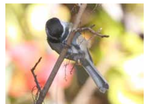
Black-Capped Chickadee