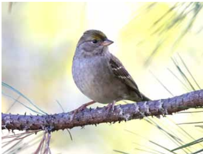
Golden-crowned Sparrow – by Cary Kerst